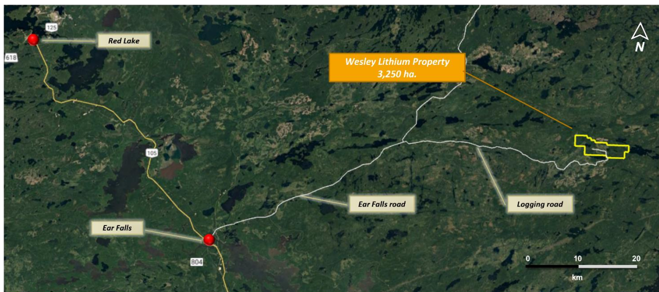
Figure 1. Regional location of the Wesley Lithium Property, northwestern Ontario.

VANCOUVER, BC – September 26, 2022, Tearlach Resources Limited (“Tearlach” or the “Company”) (TSX-V: TEA.V) is pleased to announce it has signed an option agreement to acquire 100% of seven claims totalling 3,250 hectares that comprise the Wesley Lithium Property (the “Property”) located 85 km northeast of Ear Falls, northwestern Ontario (Figure 1). The Property is located 18 km southwest of Green Technology Metals Root Lithium Project which just announced the commencement of a 24,000 m diamond drill program for mineral resource definition plus extensional and step-out target drilling. (see ASX: GT1 press release dated August 8, 2022).